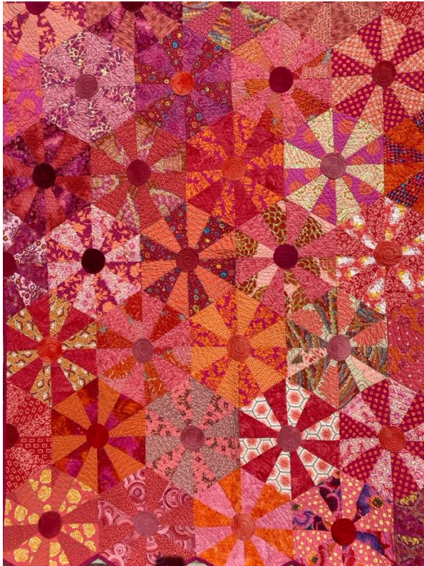
From Rainbow Quilts for Scrap Lovers