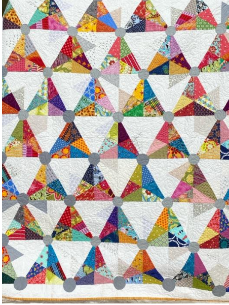
From Rainbow Quilts for Scrap Lovers