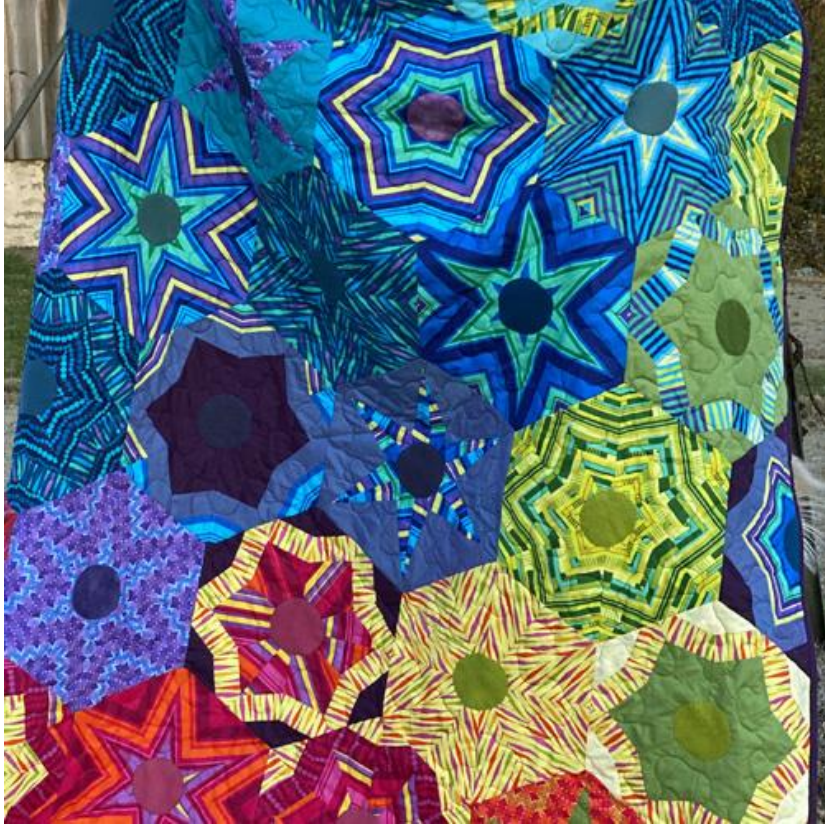
Blended Hexagon pattern