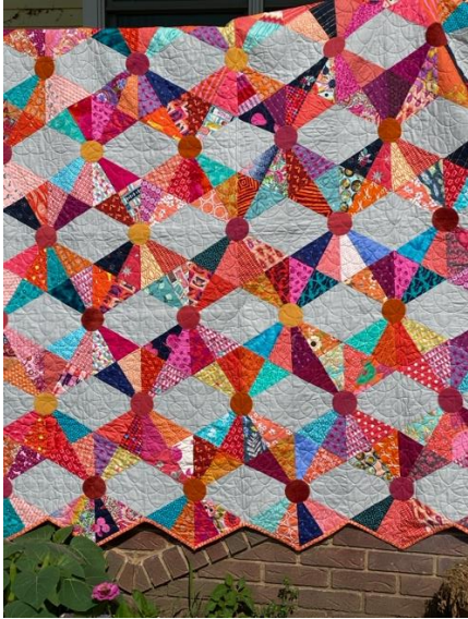
From Sensational Quilts for Scrap Lovers