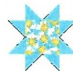
↑ Star Point Unit

Arrange the 5 Star Blocks, alternating with the 4 Print Squares, into 3 rows with 3 blocks per row. Stitch rows together to make the quilt top. Use the 3½" border strips to make borders.