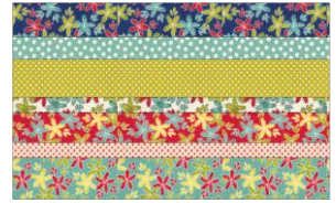
Example of strip set

Press the strip sets, pressing all the seams in one direction.