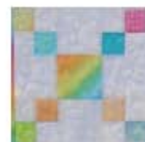
Simple 9-Patch Chain Block

Piece the 2 \frac{1}{2} " white and colored squares into four 4-patch squares.